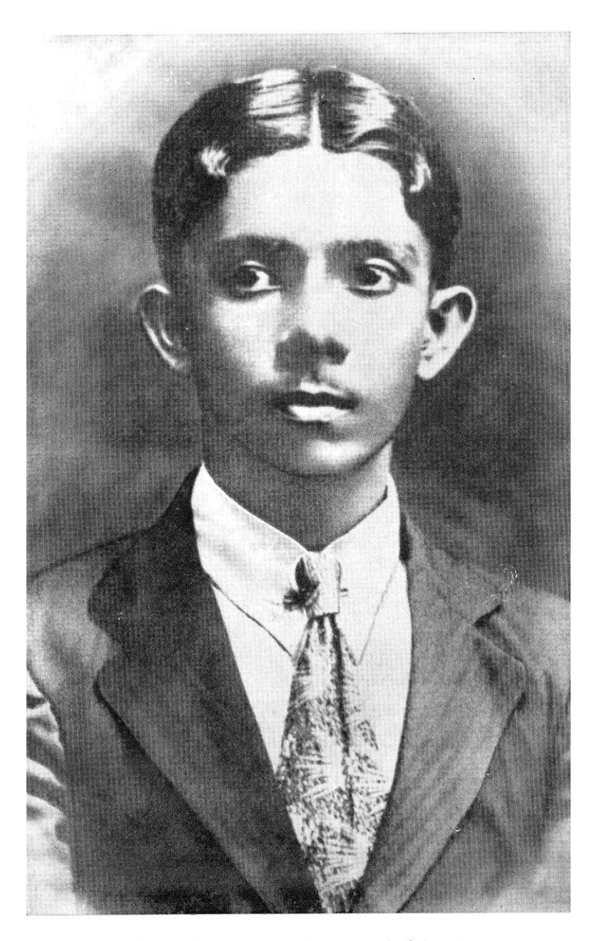
As a school boy at the age of eighteen